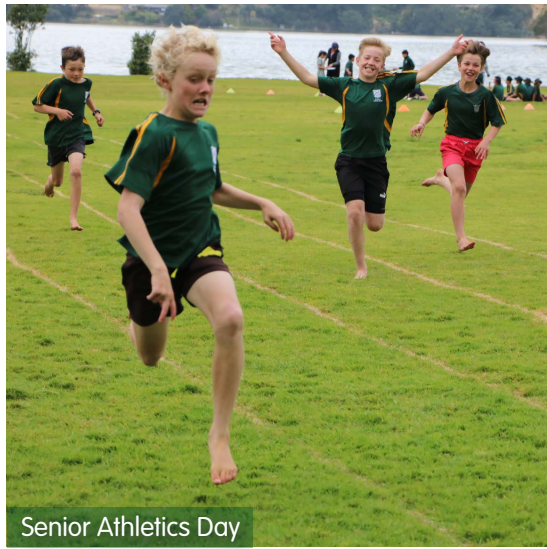
Senior Athletics Day