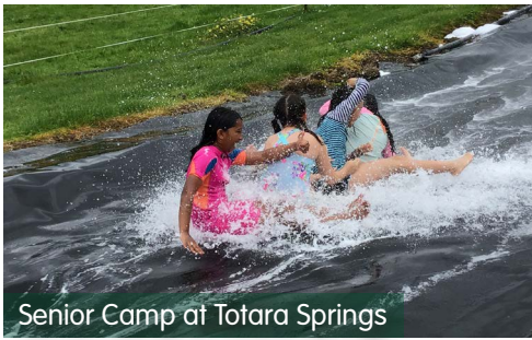
Senior Camp at Totara Springs