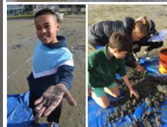
Estuary Monitoring project