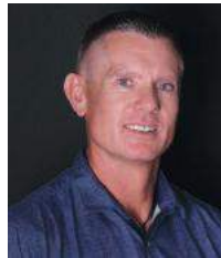
Tena Koutou Katoua

As the 2018 school year comes to a close I would like to take the opportunity to reflect on the year as a Principal and as a member of a remarkable school community. We are a high