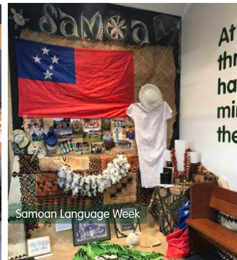
Samoan Language Week