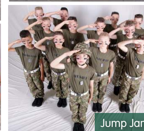
Jump Jam 2018