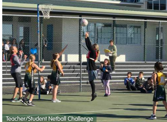
Teacher/Student Netball Challenge