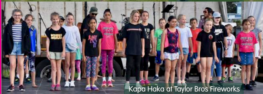
Kapa Haka at Taylor Bros Fireworks