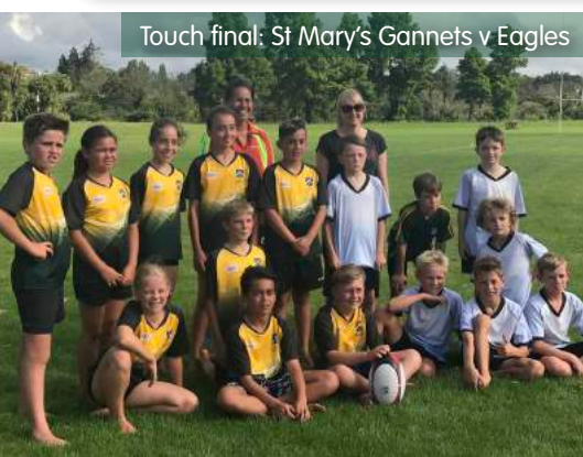
Touch final: St Mary's Gannets v Eagles