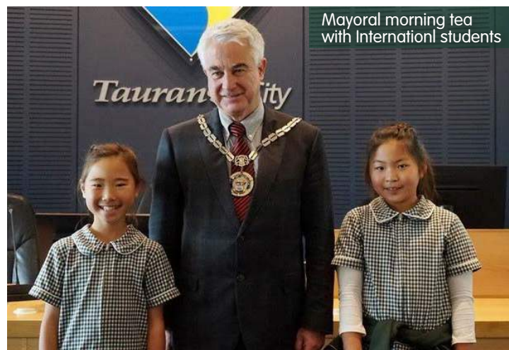
Mayoral morning tea with International students