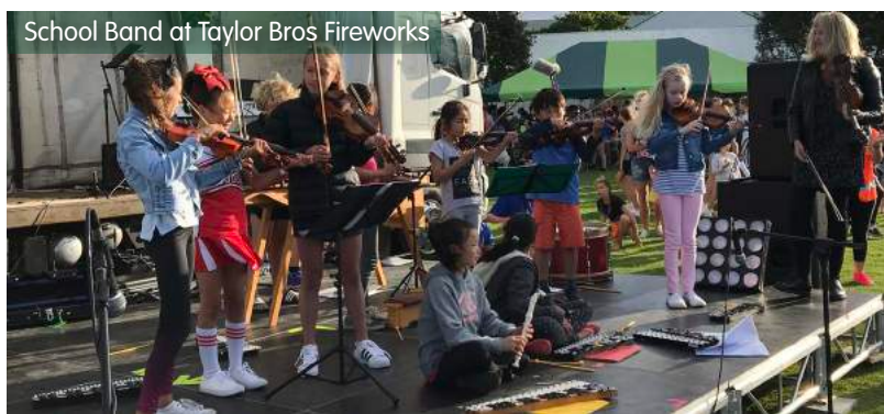
School Band at Taylor Bros Fireworks