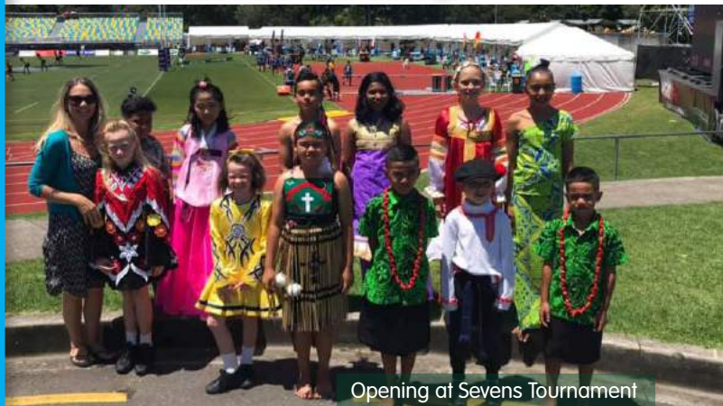
Opening at Sevens Tournament