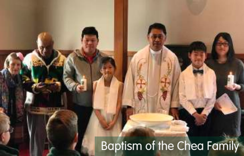
Baptism of the Chea Family