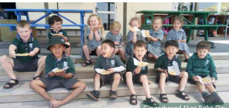
Gingerbread Man Bake Day