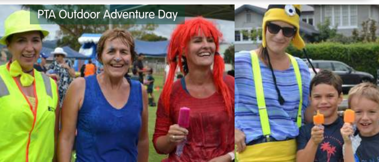
PTA Outdoor Adventure Day