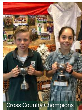
Cross Country Champions