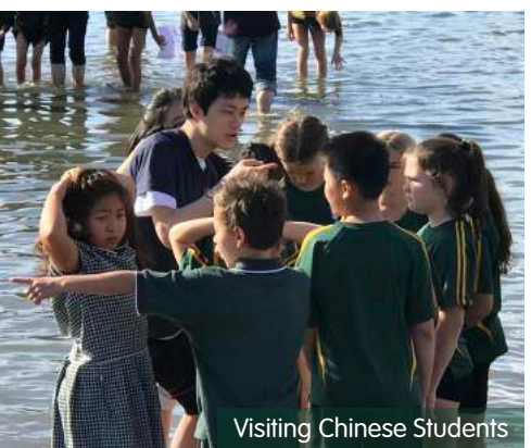
Visiting Chinese Students