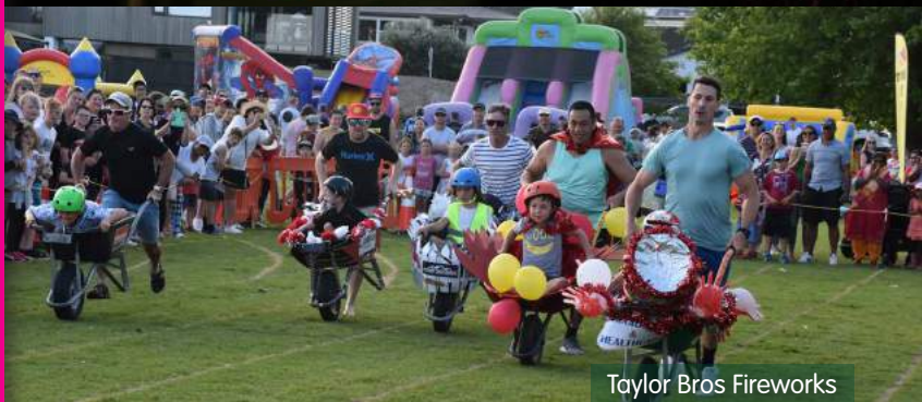
Taylor Bros Fireworks