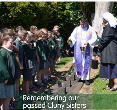
Remembering our passed Cluny Sisters