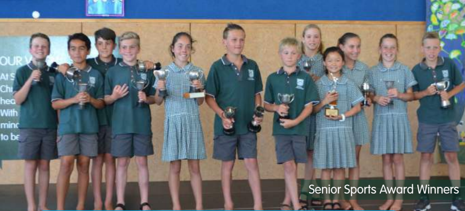
Senior Sports Award Winners