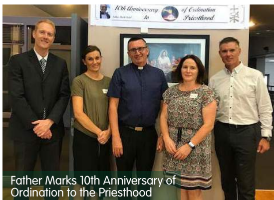
Father Marks 10th Anniversary of Ordination to the Priesthood