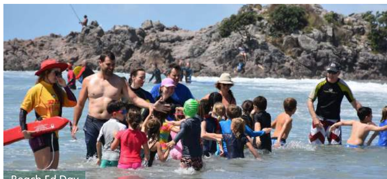
Beach Ed Day