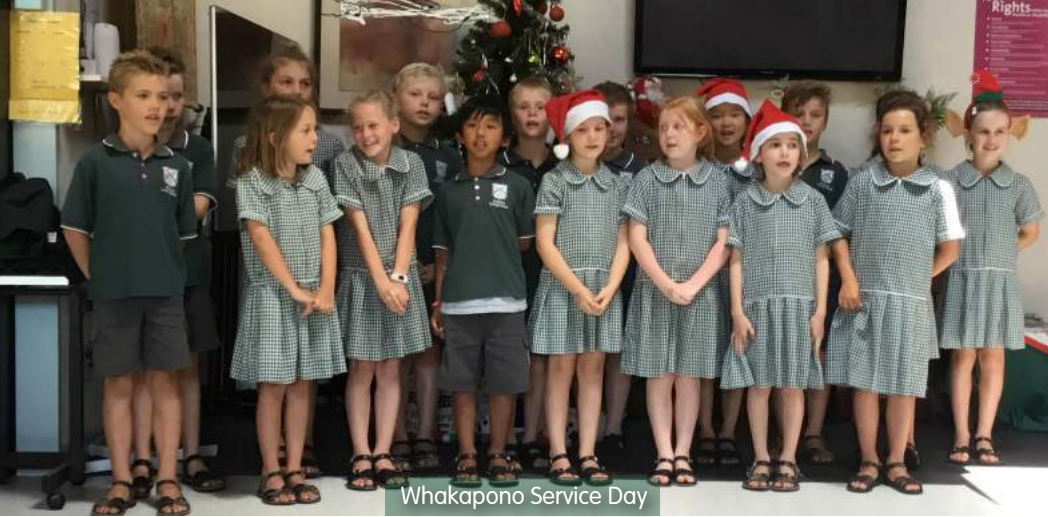
Whakapono Service Day