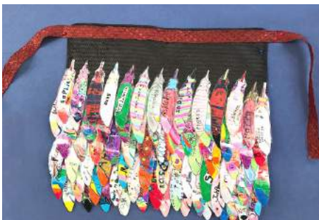
PHOTO: Pono Tahi tamariki agreed to their Hub Treaty by creating and signing feathers for their korowai.