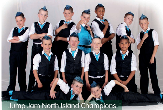
Jump Jam North Island Champions