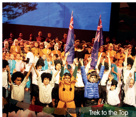
Trek to the Top