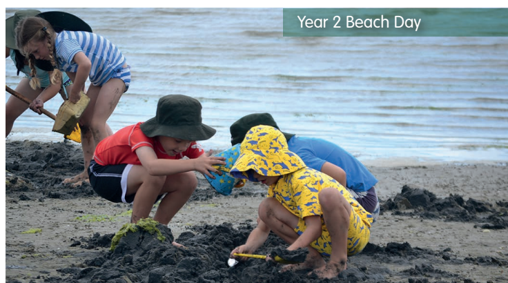
Year 2 Beach Day