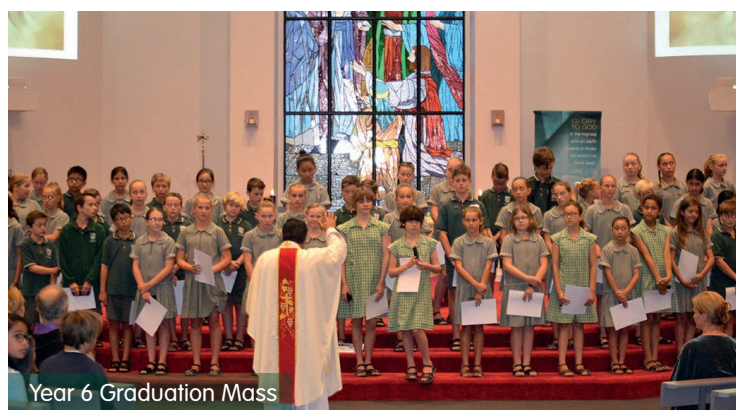
Year 6 Graduation Mass