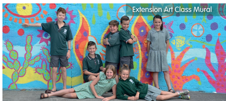
Extension Art Class Mural

The building firm of Street & Street pegged out the land for St Mary's School in 1941, the timber arrived in August and the three-classroom school was ready in January for the 1942 school year. 2017 will be a significant event on our school calendar, when St Mary's Catholic School celebrates 75 years since first opening for instruction. Please go to our school website to register for this historic event.