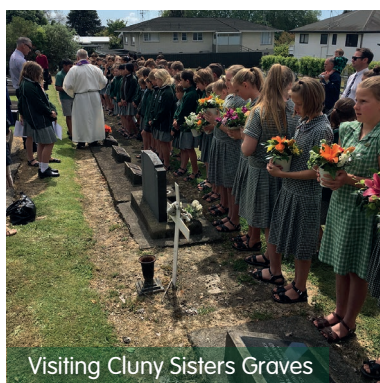
Visiting Cluny Sisters Graves