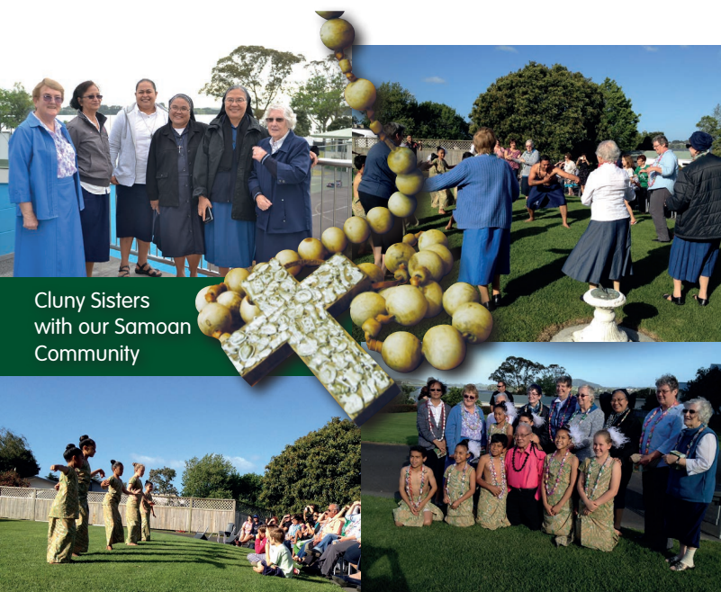
Cluny Sisters with our Samoan Community