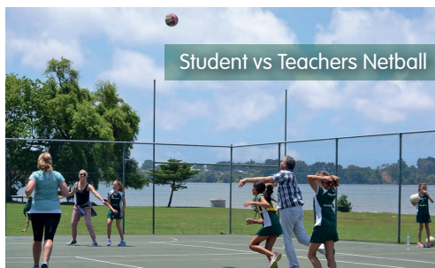
Student vs Teachers Netball