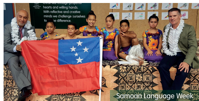
Samoa Language Week

All buses will commence as normal on Wednesday 1 February.