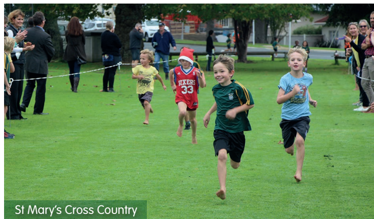
St Mary's Cross Country