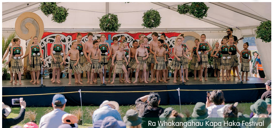
Ra Whakangahau Kapa Haka Festival