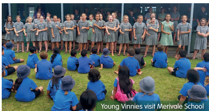
Young Vinnies visit Merivale School