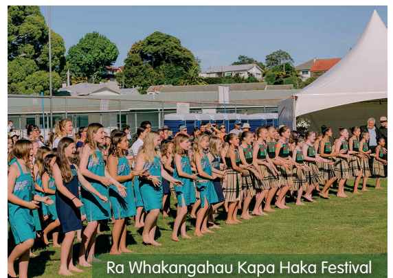
Ra Whakangahau Kapa Haka Festival