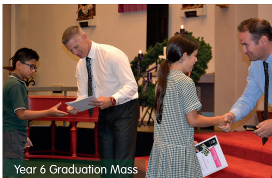
Year 6 Graduation Mass