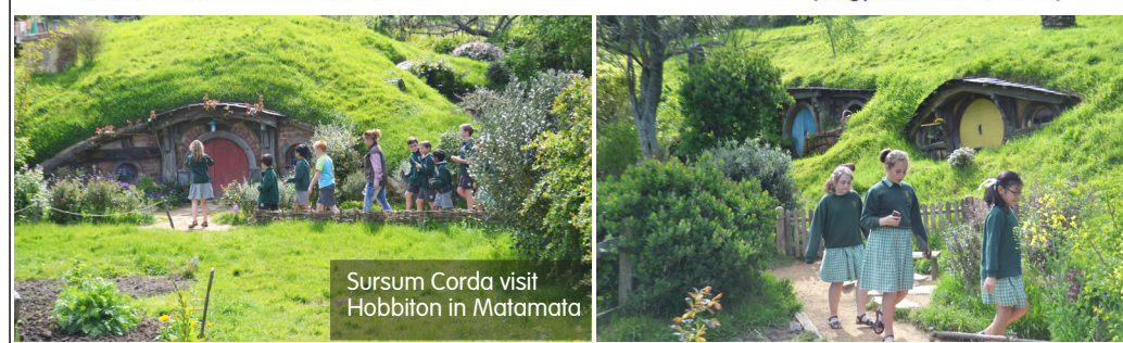
Sursum Corda visit Hobbiton in Matamata