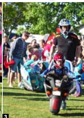
1. Quiz Night Best Dressed 2. Fireworks Gala Wheelbarrow Race Winners - Room 11 3. Wheelbarrow Race at St Mary's Gala