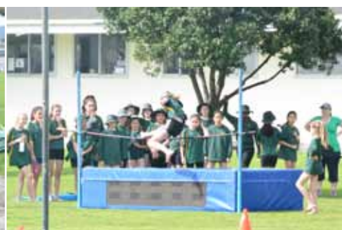
Senior Athletics Day