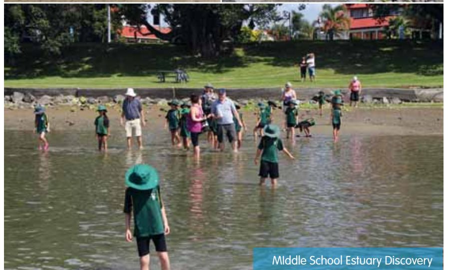
Middle School Estuary Discovery