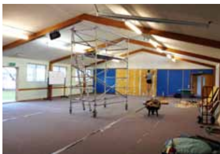
New Entrants Classroom - before & after

I look forward to further educating and informing parents of our progressive approach to educational practices during 2015.