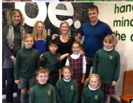
1. South Cluster 2. Sponsored badminton equipment 3. Gymnastics Team 4. Sporting Stars visit our school